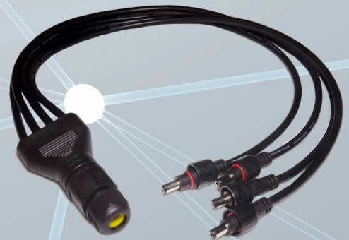
WSC14-4P1J (4 LEADS)