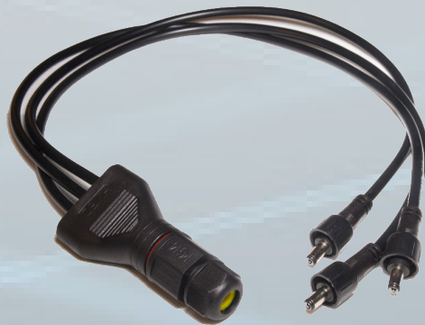
WSC14-3P1J (3 LEADS)