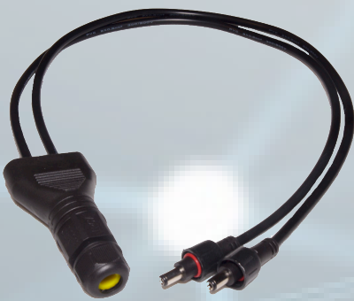
WSC14-2P1J (2 LEADS)