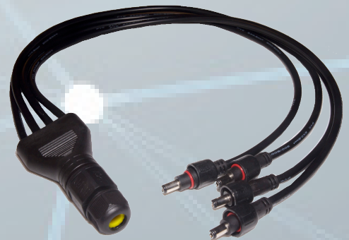
WSC14-4P1J (4 LEADS)